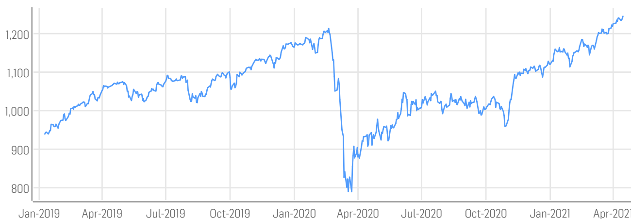
■ Solactive GBS Developed Markets Europe ex Germany Large & Mid Cap EUR Index TR