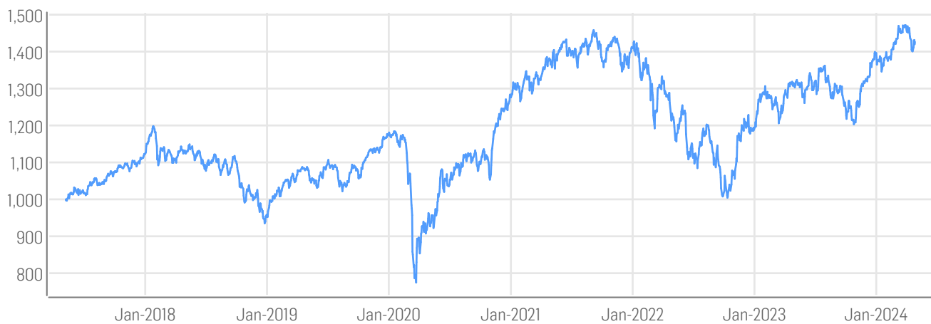
■ Solactive GBS Developed Markets ex North America All Cap USD Index NTR