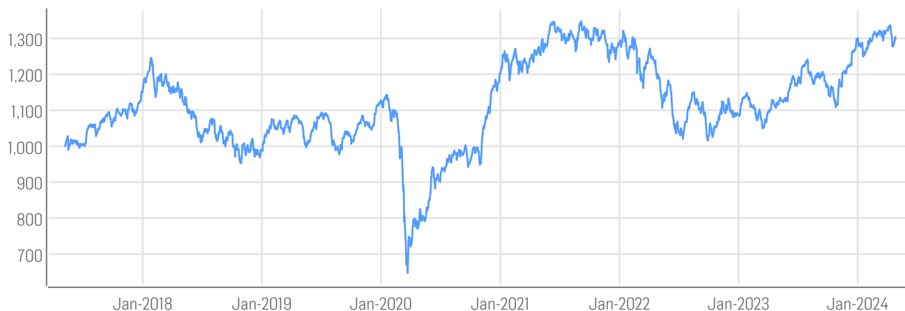
■ Solactive GBS Emerging Markets ex China ex Taiwan Investable Universe USD Index NTR