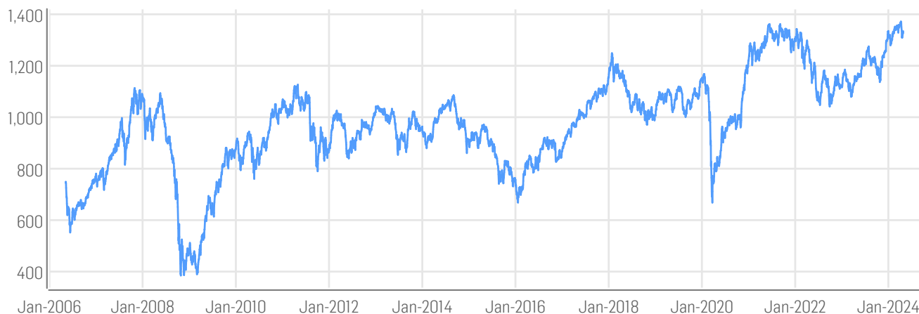
■ Solactive GBS Emerging Markets ex China ex Taiwan Large & Mid Cap USD Index TR