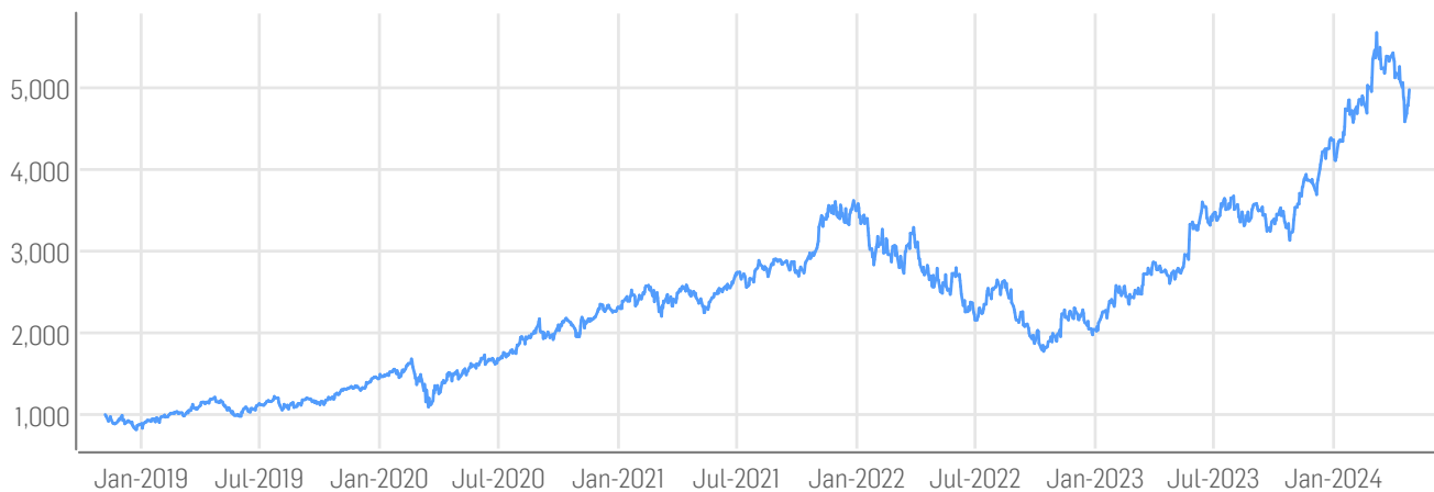
■ Solactive US AI Semiconductor Chip Makers Index NTR