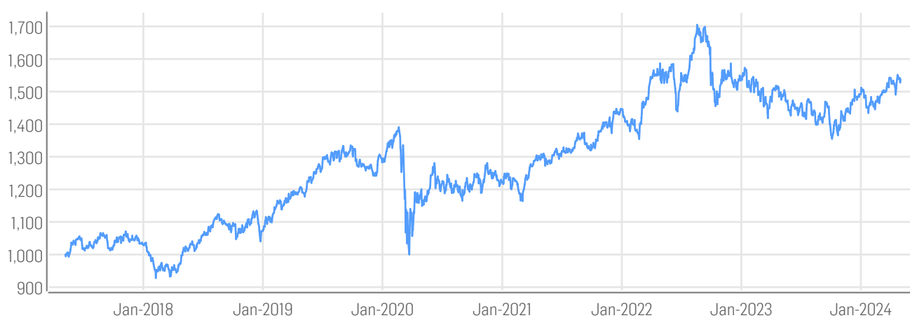
■ Solactive GBS Global Markets Investable Universe Core Infrastructure GBP Index NTR