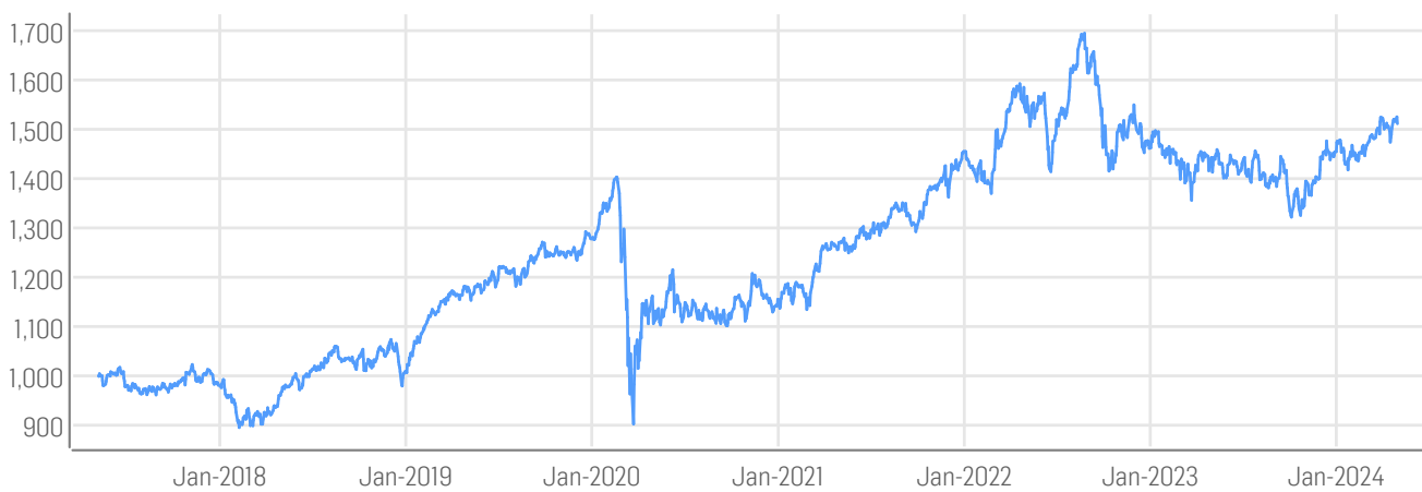
■ Solactive GBS Global Markets Investable Universe Core Infrastructure EUR Index NTR