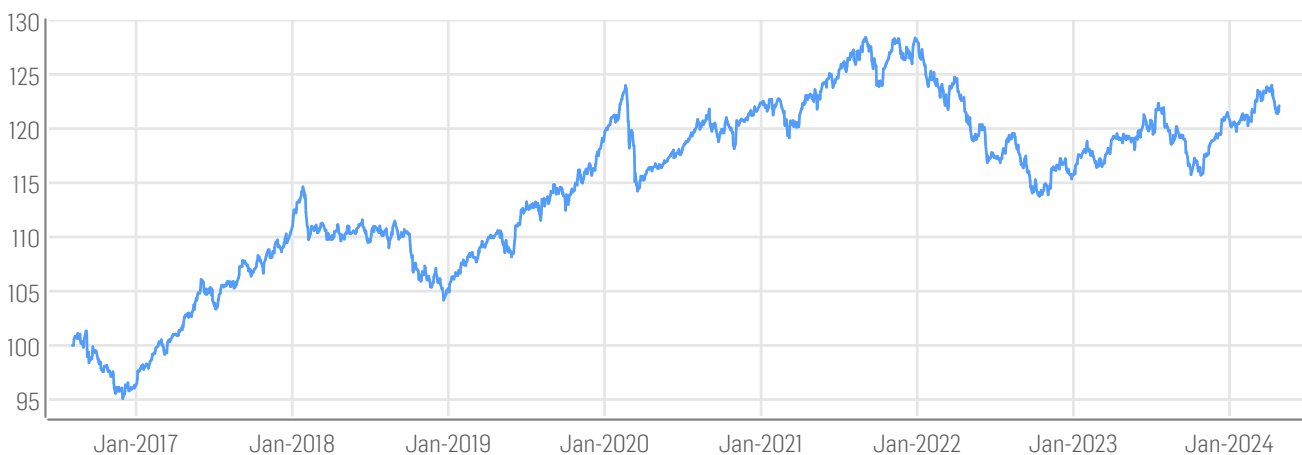
■ Solactive Global Multi-Asset ETF Portfolio 5% VT ZAR FX Hedged Index