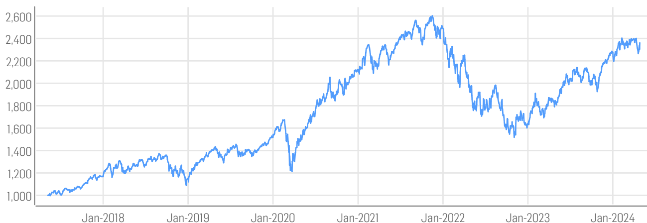
■ Solactive GBS Global Markets Digital Infrastructure All Cap USD Index PR