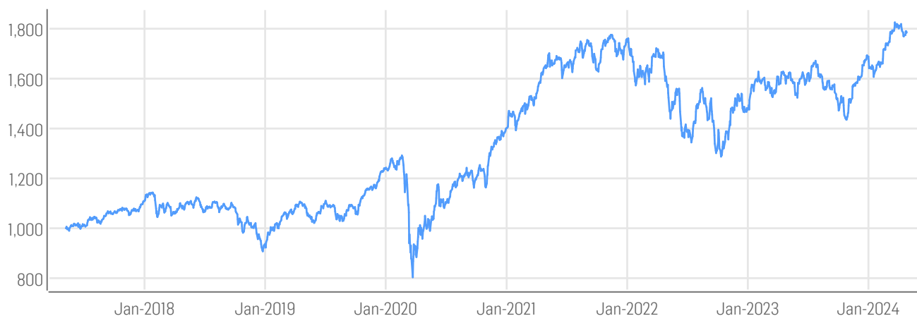
■ Solactive GBS Global Markets Environmental Services All Cap USD Index PR