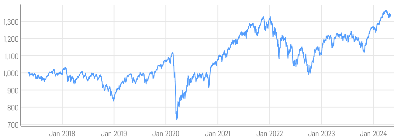
■ Solactive GBS Developed Markets Europe ex United Kingdom All Cap EUR Index PR