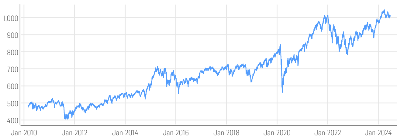
■ Solactive Transatlantic Biodiversity Screened 150 CW Decrement 50 Index