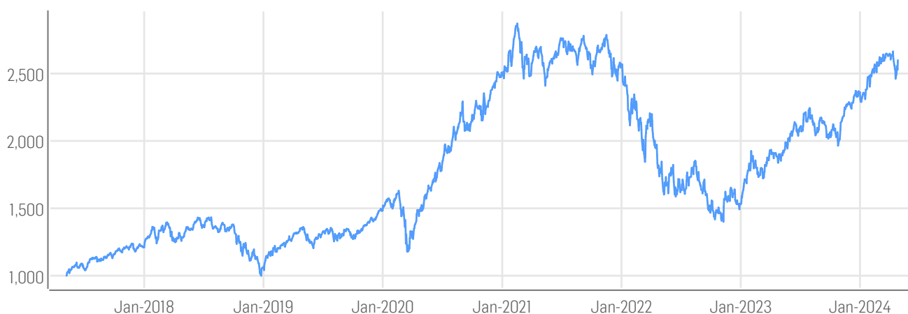
■ Solactive GBS Global Markets Digital Entertainment All Cap USD Index PR