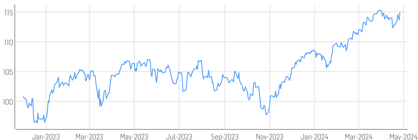
■ Solactive Osmosis Resource Efficient Diversified EMEA Core Equity Index PR