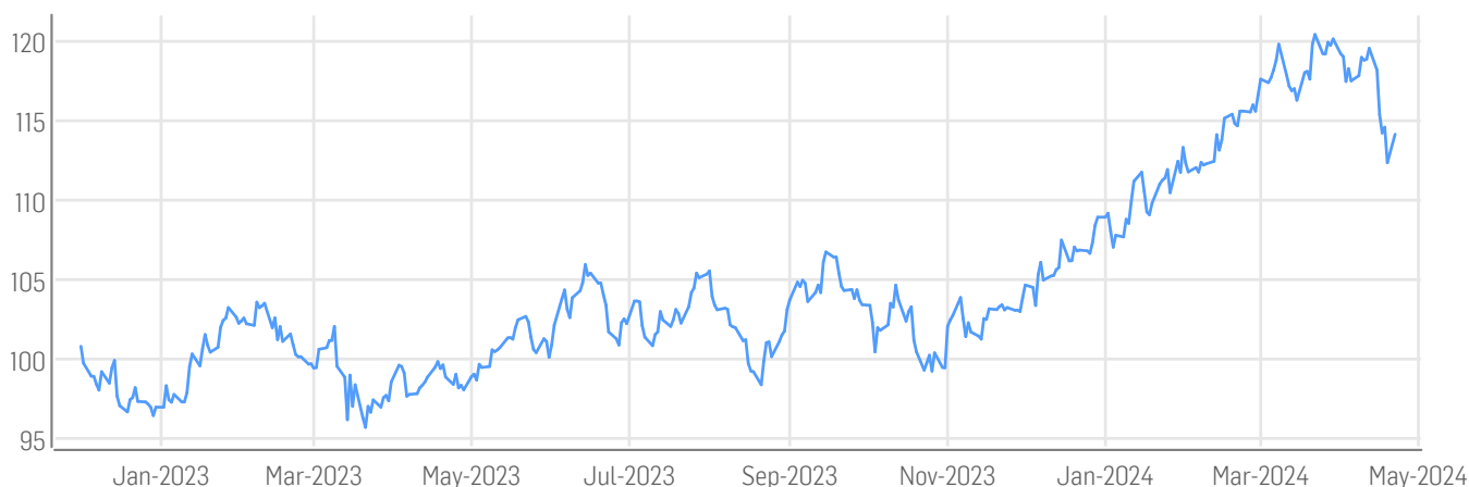
■ Solactive Osmosis Resource Efficient Diversified APAC Core Equity Index TR