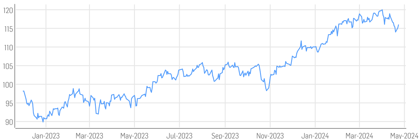
■ Solactive Osmosis Resource Efficient Diversified NAM Core Equity Index PR