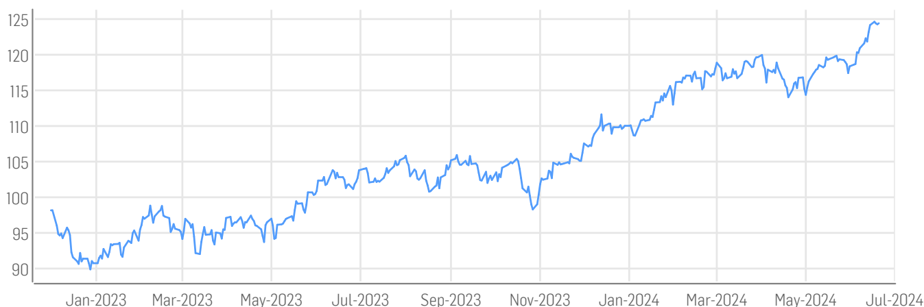
■ Solactive Osmosis Resource Efficient Diversified NAM Core Equity Index PR