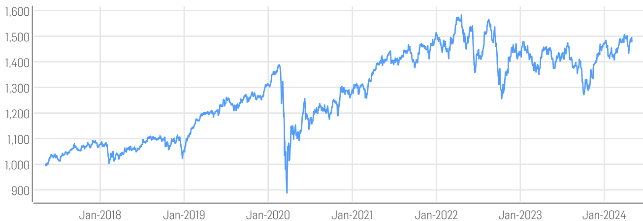
■ Solactive GBS Global Markets Investable Universe Core Infrastructure USD Index NTR