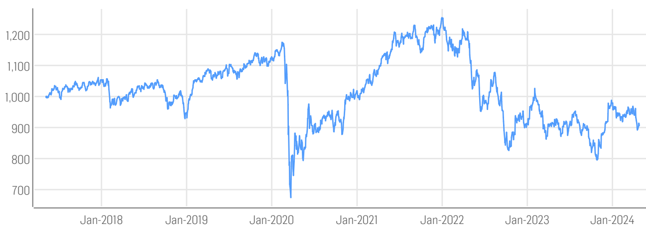
■ Solactive GBS Developed Markets Investable Universe Property USD Index PR