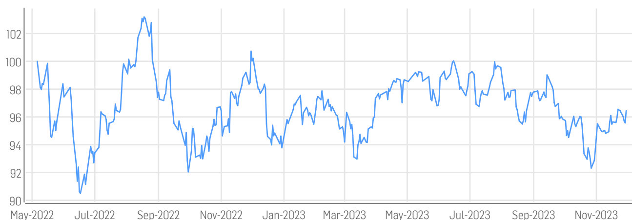
■ Börse Online Aktien für die Ewigkeit Index