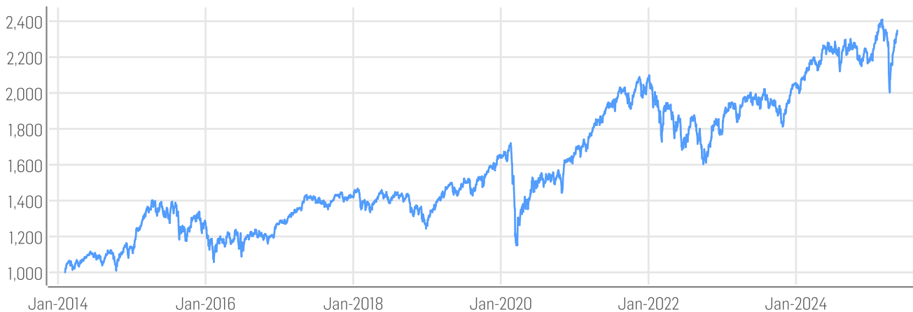
■ Solactive ISS ESG Developed Markets Europe Net Zero Pathway Index NTR