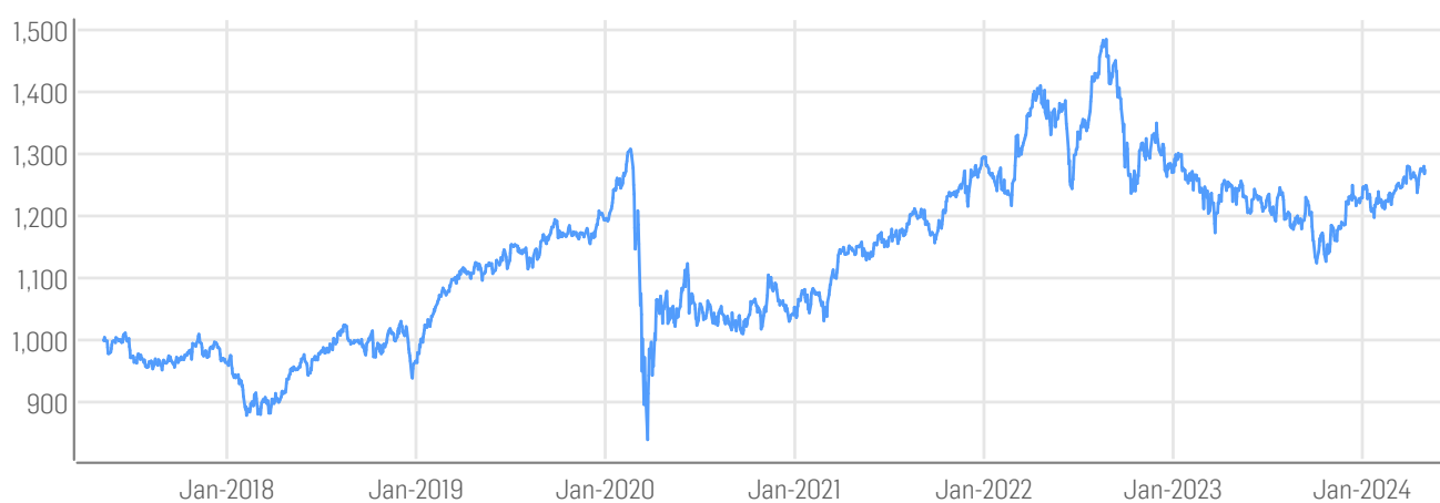
■ Solactive GBS Global Markets Investable Universe Core Infrastructure EUR Index PR