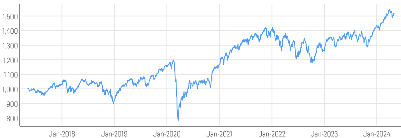
■ Solactive GBS Developed Markets & South Korea ex United States All Cap GBP Index TR