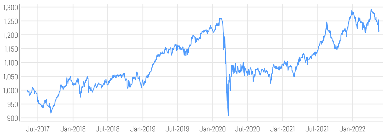
■ Solactive Developed Markets Sustainable Dividend Select Index CA NTR