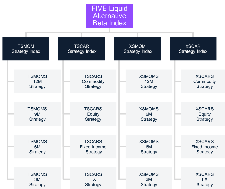
Figure 3: Index-structure LAB

The FIVE Liquid Alternative Beta Index Index is risk-controlled and aiming at realizing a target volatility of 5% per annum. The theoretical leverage is capped at a factor of 5. An EWMA based volatility estimator is used to realize the aforementioned volatility level, where lambda equals 0.98 and either uses 19 or 89 return observations, whichever measures the higher volatility.