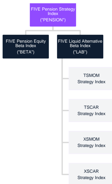
Figure 1: Index-structure PENSION

While the BETA Index consists of a portfolio of global equity index futures, the LAB Index is an aggregation of different alternative risk premia investment strategies.