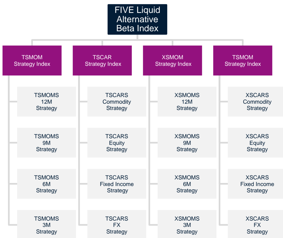
Figure 3: Index-structure LAB

The FIVE Liquid Alternative Beta Index Index is risk-controlled and aiming at realizing a target volatility of 5% per annum. The theoretical leverage is capped at a factor of 5. An EWMA based volatility estimator is used to realize the aforementioned volatility level, where lambda equals 0.98 and either uses 19 or 89 return observations, whichever measures the higher volatility.