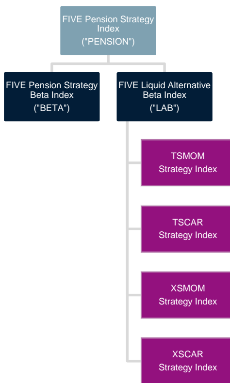
Figure 1: Index-structure PENSION

While the BETA Index consists of a portfolio of global equity index futures, the LAB Index is an aggregation of different alternative risk premia investment strategies.