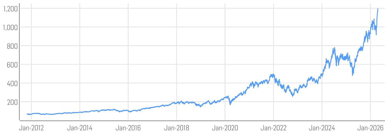
■ Solactive Semiconductor (SMH) Hedged to CAD 4% Decrement Index