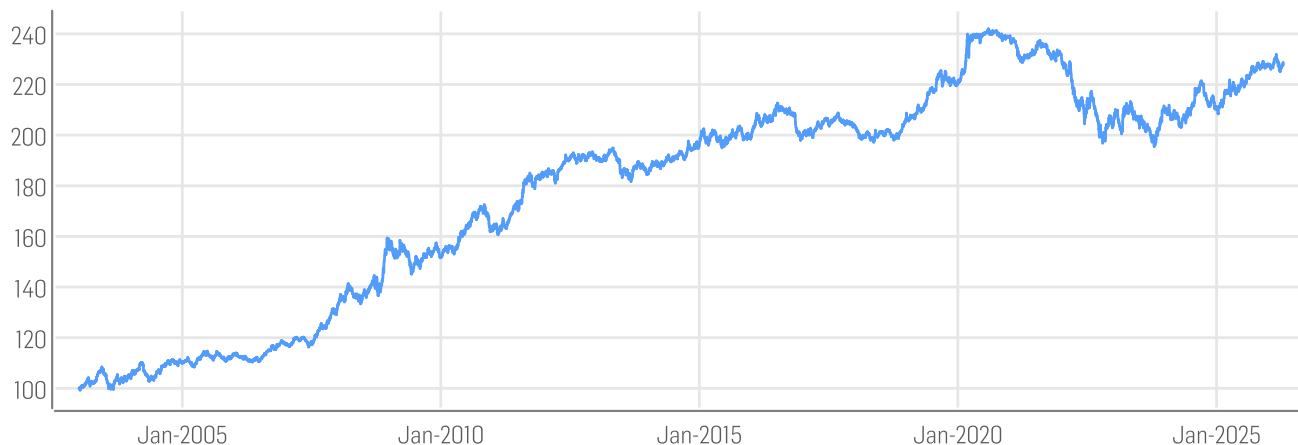
■ Solactive Future Series 5-Day Roll 10y Treasury Note Fed Funds Total Return USD Index