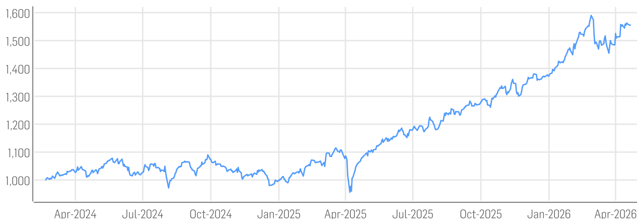
■ Solactive Pacer Developed Markets International Cash Cows 100 Index NTR