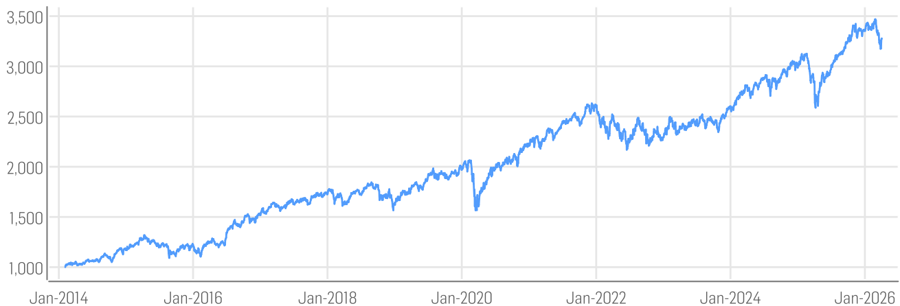
■ Solactive ISS ESG Global Markets Net Zero Pathway Custom GBP Index PR